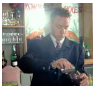
◀ Foxholes in 1998. The popular training restaurant is open to the public during term time.