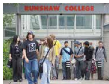
➤ The old student entrance was remodelled and modernised in 2010.