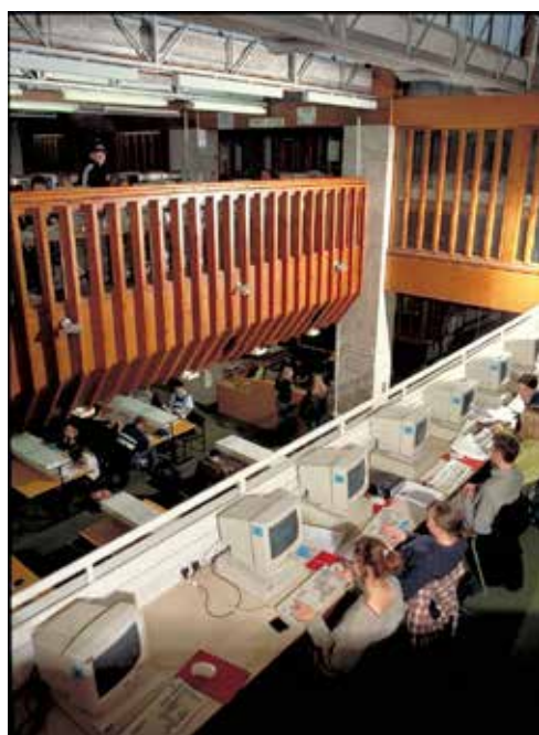
We have always offered the very latest in technology for our students to use.