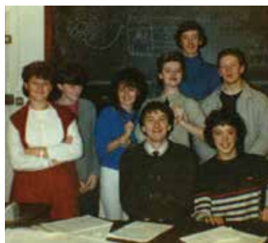
1984: Fun and Frolics at Runshaw.